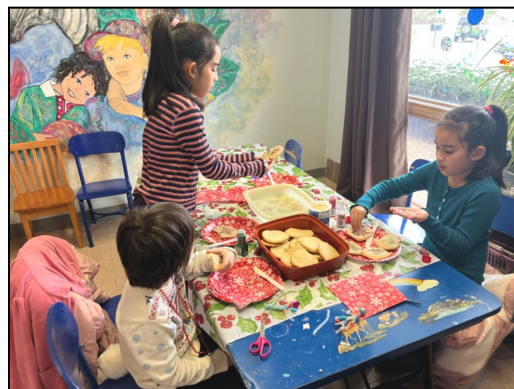
Photo of decorating cookies in Sunday school